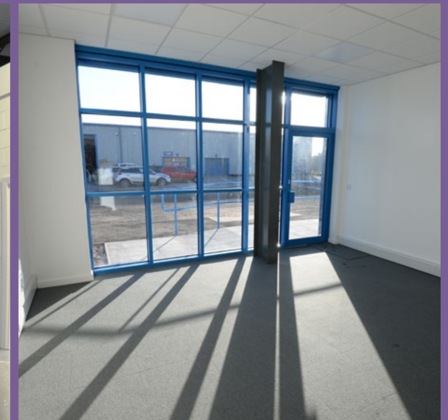
Indicative images of units on the estate

Jon Swain 07810 435 071 jonswain@masonpartners.com